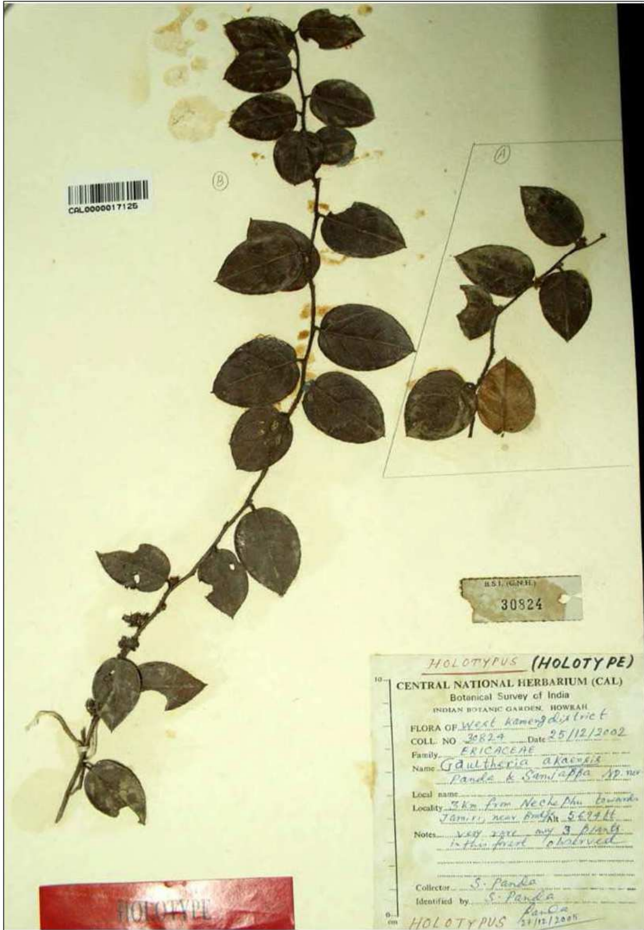
Figure 1. Holotype of Gaultheria akaensis Panda & Sanjappa (CAL). Arunachal population